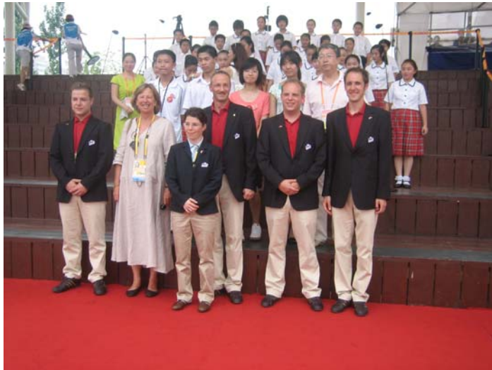
Prinzessin Nora of Liechtenstein with the Delegation on the occasion of the Welcome Ceremony