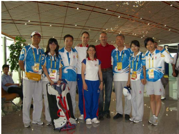
Without all the volunteers there could have been no Olympic Games